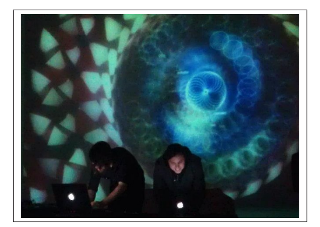
Figure 4 . Yig in performance at the Network Music Festival in Birmingham, UK, powered by OSCthulhu.

One manner in which networked ensembles may take advantage of this capability is through the usage of what may be called Remotely Rendered Synthesis. In many network music bands, including most of the work conducted by The Hub and PLOrk, network messages are transmitted among multiple participants to influence each other's behavior. Each member then uses their own computer to output their own sounds. In comparison, in a Remotely Rendered Synthesis configuration, each of the participants share their sound synthesis descriptors with each other member beforehand(in the case of Glitch Lich, SuperCollider SynthDefs are used); then, a Sound State is constructed that is mirrored on each participant's own computer. This Sound State is similar to a Game State in Sweeny's GCSM, except that the data being synchronized represents the state of a sonic world instead of a virtual game world. OSCthulhu keeps track of the Sound State present on each user's computer. Whenever a member makes a change to their particular version of the Sound State, this change is replicated on the server, and shared with the whole group. Then, each member's computer outputs audio that contains the full sound present in the piece, including audio that is being produced by other members. This is useful for network music performances wherein all the members are not geographically co-located.