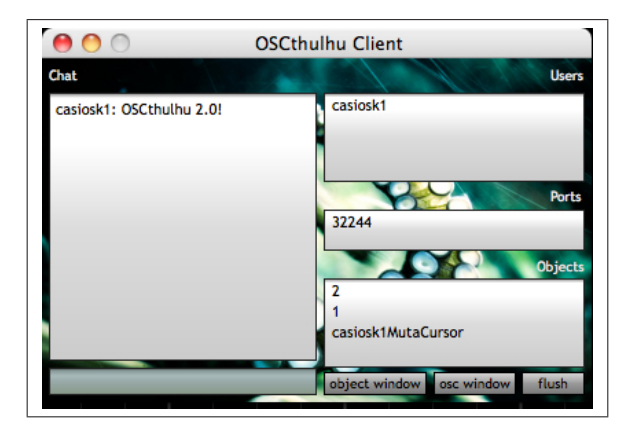
Figure 1. Screen capture of the SyncObject and Chat window in OSCthulhu 2.0